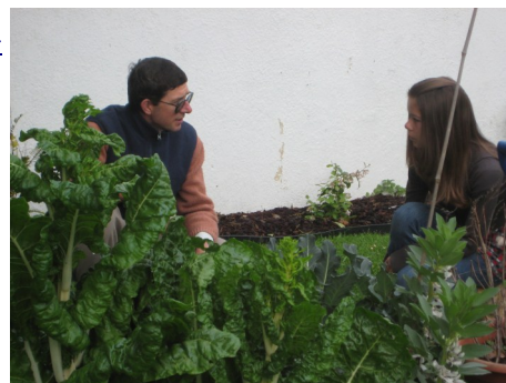
Gardening tips with Supergrans!

We will of course site you/your groups as the activity on display!!